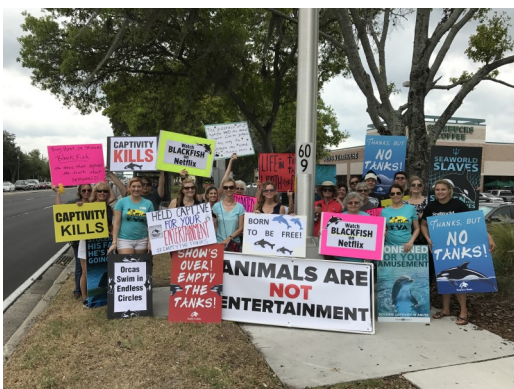
Empty The Tanks Demo