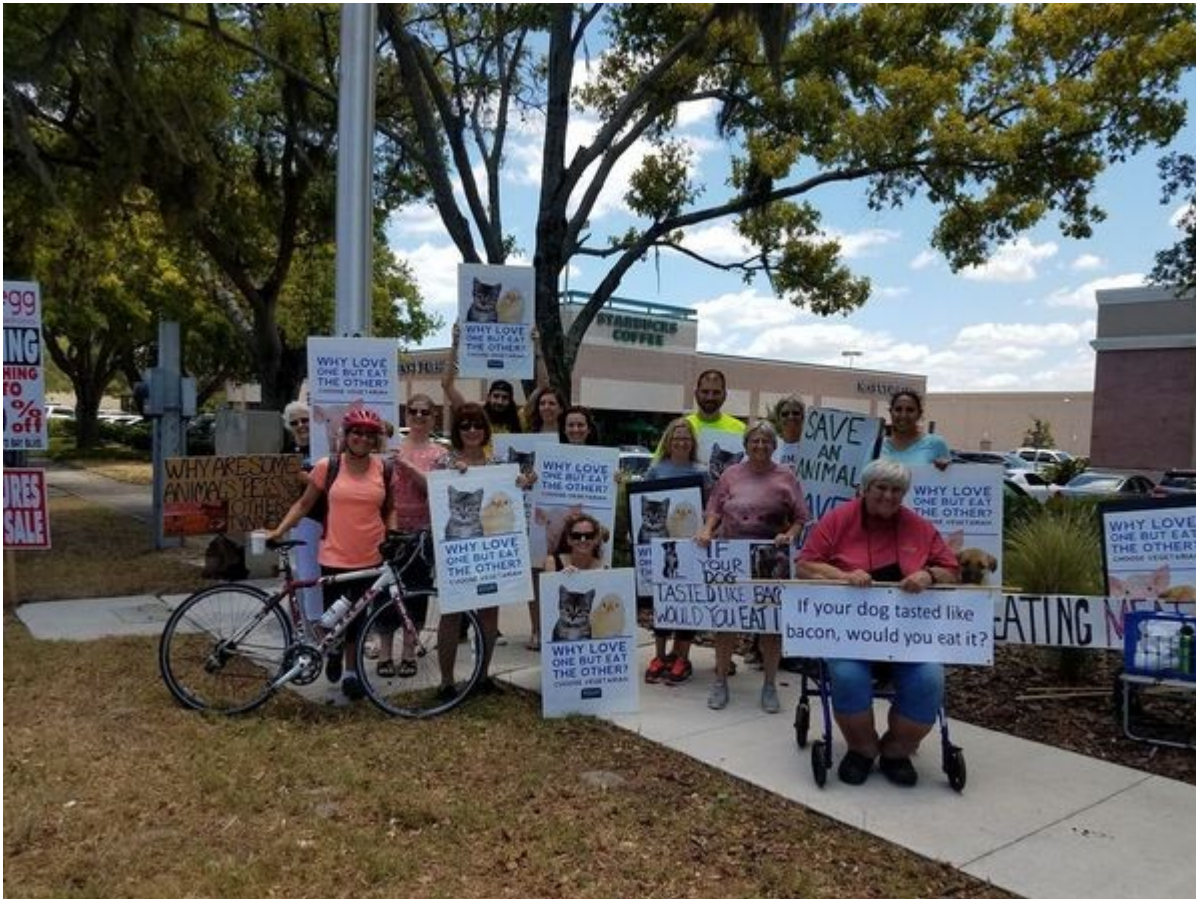
Demo held at the Clearwater Mall

On May 6th, 2017, FVA held a "Why Love One But Eat The Other" demo at the Clearwater Mall.