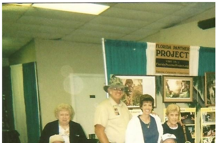
FL Panther Project, circa 2004