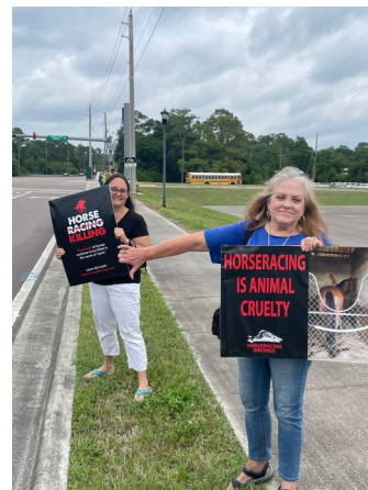
Horse Racing Demo