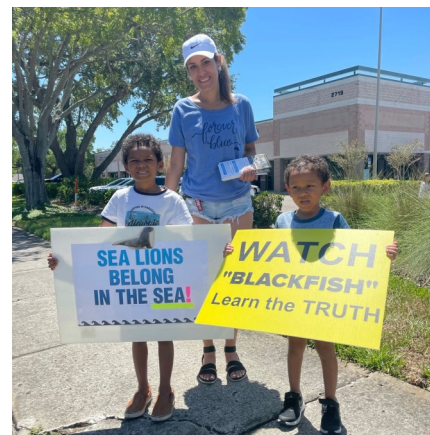
Empty The Tanks