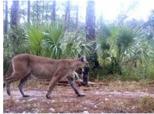
Florida Panther mom with cub