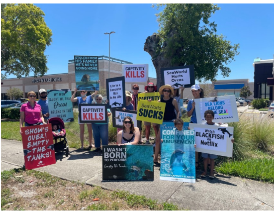
Empty The Tanks