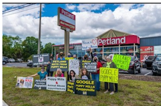
Puppy Mill Demo