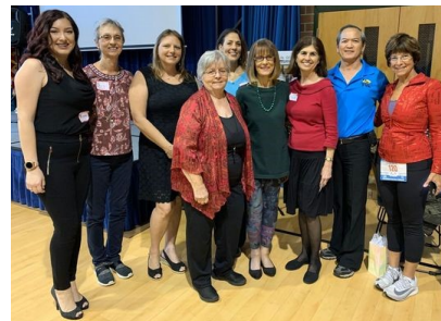
FVA Board at Have-A-Heart Fundraising Dinner & Silent Auction held at Solid Rock Community School