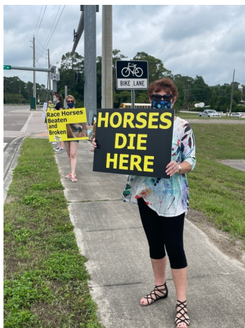
Horse Racing Demo